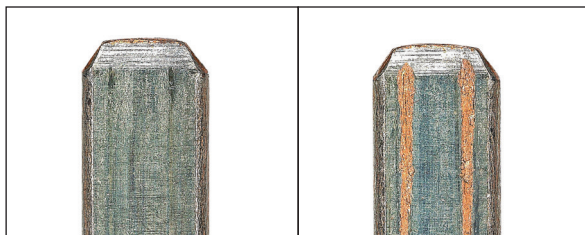
760G 6.7 MM CYCLES

This test monitors fretting cycles (micromotion) of terminals until resistance increases 100 milliohms over the static baseline, to predict the lifetime of terminals.