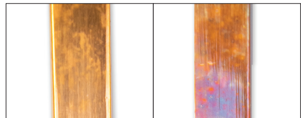
760G SLIGHTLY TARNISHED (1A)

This test indicates a lubricant's ability to protect against copper corrosion using a 12 segment scale from 'Slightly Tarnished' (1A) to 'Very Tarnished' (4C)